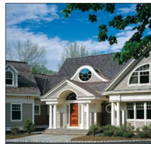
Jan Gleysteen Architects, Inc.