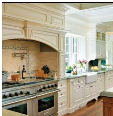
Jan Gleysteen Architects, Inc.