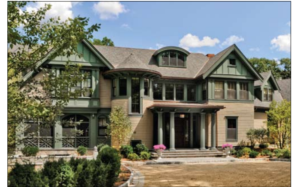
Gleysteen Design LLC

Marc: The most important component for staying within your budget is open and honest communication with your builder. It is the builder's responsibility