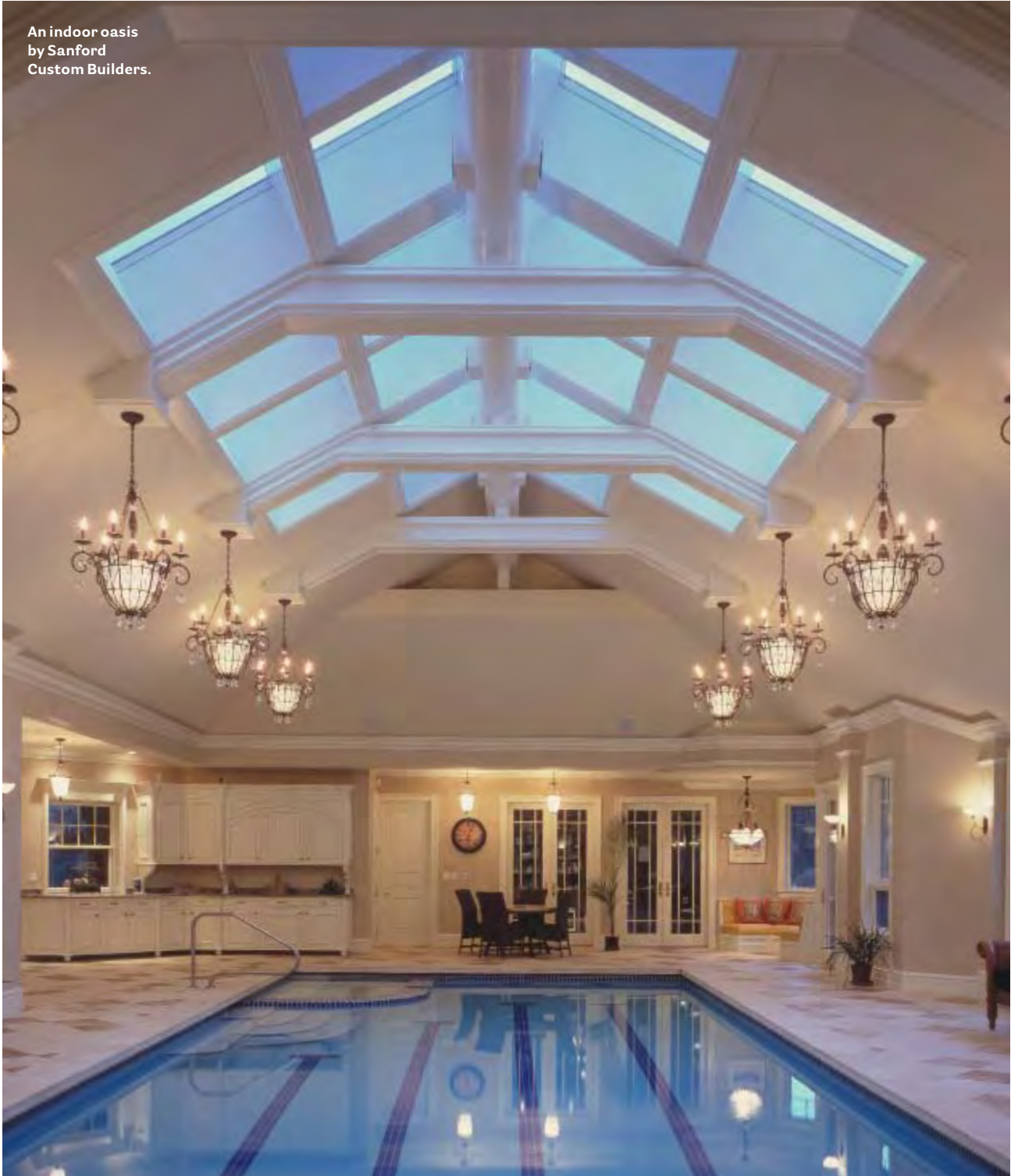
An indoor oasis by Sanford Custom Builders.